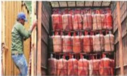
The PMUY was launched in 2016 to provide poor households access to liquefied petroleum gas (LPG). File

The PMUY was launched in 2016 to provide poor households access to liquefied petroleum gas (LPG) as a cooking fuel and discourage the use of traditional