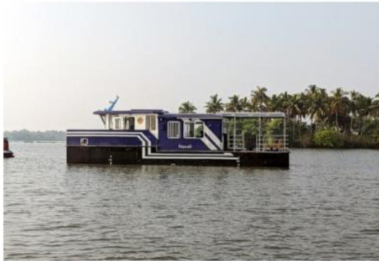
Green and fast: Barracuda , said to be India's fastest solar-electric boat, was launched off Aroor on Wednesday.

Named after the swift, long fish, Barracuda was designed by Navalt and can be deployed even in the rough seas as a workboat to ferry up to 12 passengers and cargo. The 14-metre-long, 4.4-metre-wide vessel can attain a top speed