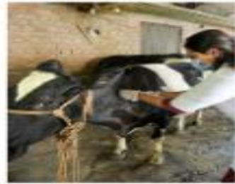
Doctor vaccinating a cow who has been infected with lumpy skin disease.

The disease was spread in 23 States, and Rajasthan, Maharashtra, Gujarat, Pun-