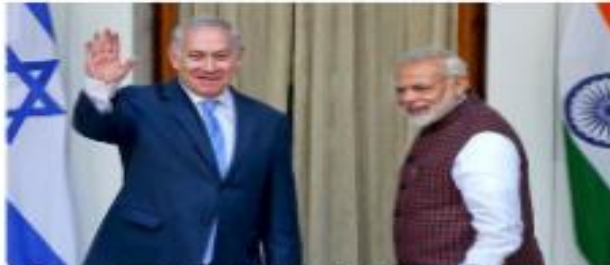
Vital discussion: Narendra Modi and S. Jaishankar held several rounds of talks with stakeholders since the conflict began

"Had a productive exchange of views with PM Netanyahu on the ongoing Israel-Hamas conflict, including shared concerns on the safety of maritime traffic. Highlighted India's consistent stand in favour