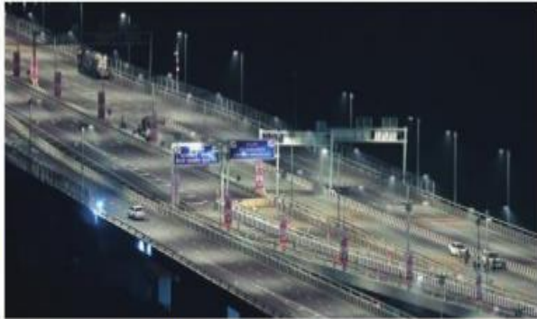
The Mumbai Trans Harbour Link, or Atal Setu, ahead of the opening. Amit Chakravarty

The two-carriageway, six-lane bridge – comprising a 16.5-km long sea link and 5.5 km land viaducts on the approach at both ends – was constructed at a cost of over Rs 21,200 crore, including a loan of Rs 15,100 crore from