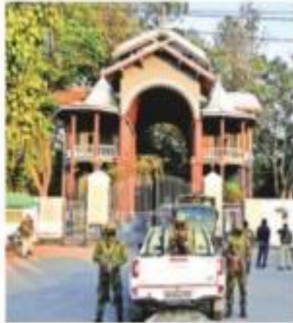
Paramilitary troopers stand guard outside Kangla Fort, Imphal.

Both the organisations armed themselves and their membership grew rapidly during the conflict, sources had earlier told The Indian Express .