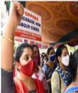
The government issued memorandum on January 1.

Till now, the rules provided for the family pension to first go to the surviv-