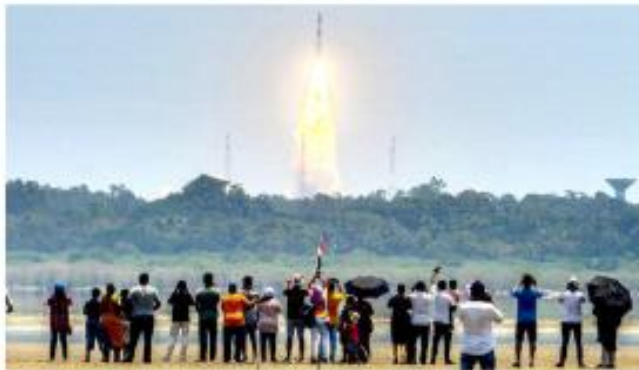
From Earth: A satellite placed in halo orbit around L1 point has the advantage of viewing the Sun without any eclipse.

Aditya-L1, the first Indian space-based observatory to study the sun, was launched on September 2, 2023 from the Satish Dhawan Space Centre in Sriharikota. Subsequently, ISRO Telemetry Tracking and Command Network (IS-