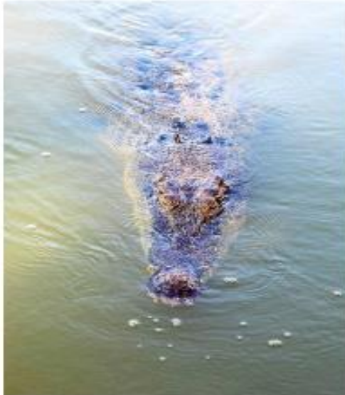
During brumation reptiles can slow metabolism significantly, allowing them to go weeks or even months without eating.

Researchers have observed instances of brumation in various reptilian species across habitats