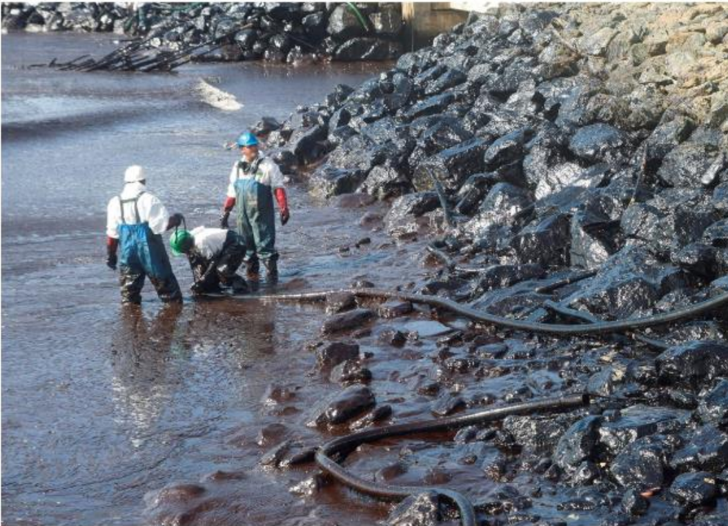
Workers from Oil Mop Environmental Services (OMES) pump out oil from a spill off Lambeau Village river mouth, in Tobago Island, Trinidad and Tobago, on Friday. The country is considering declaring an international emergency to deal with the spill, which has stained kilometres of its shores and threatens to spread to its Caribbean neighbors. The owner of the vessel whose sinking caused the spill is yet to be determined.