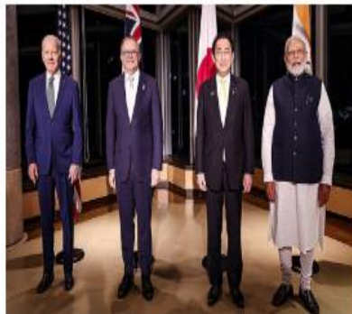
PM Narendra Modi with leaders of U.S., Australia and Japan during the Quad Leaders' Summit last year in Hiroshima, Japan.

Mr. Garcetti, who was speaking at a discussion with envoys from Australia and Japan and former officials at the Indian Embassy