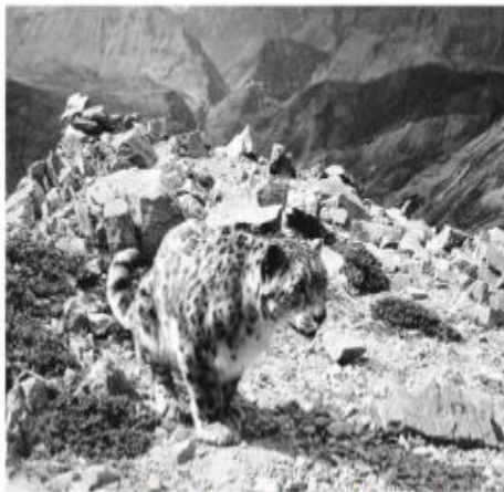
Future of the 'ghost' is in a way linked to the future of Indians.

Yet, a national effort to count snow leopards across its range remained daunting