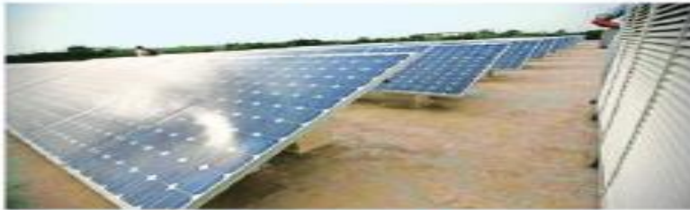
The 1 crore households will also get 300 units of free power

Through this scheme, households will be able to save electricity bills as well as earn additional income through sale of surplus power to DISCOMs. A 3-kW system will be able to generate more than 300 units a month on an average for a household.