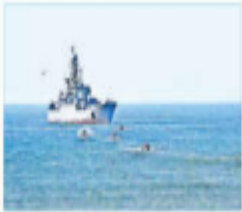
Draft didn't say how the border might be changed. File

In its official submission, the defence ministry said that a Soviet measurement of the border from