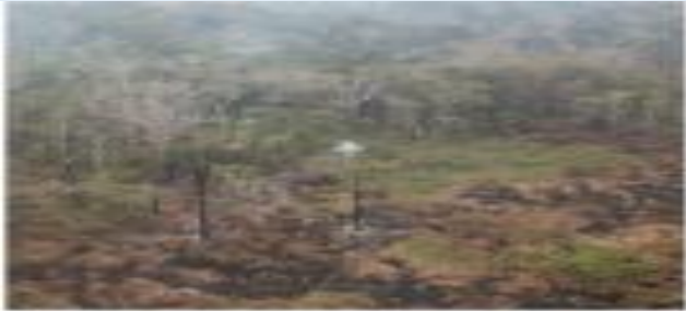
Burning vegetation in a rainforest in Yanomami indigenous land, Roraima state, Brazil.