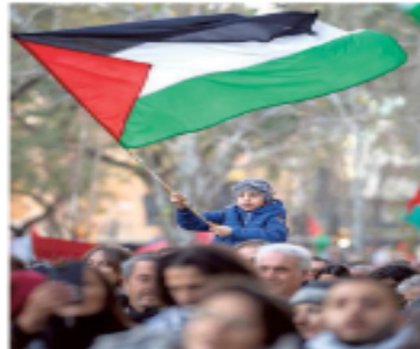
A boy waving a Palestinian flag during a march in Spain.

In a separate message released online, Mr. Harris said Ireland believed that recognising a Palestinian