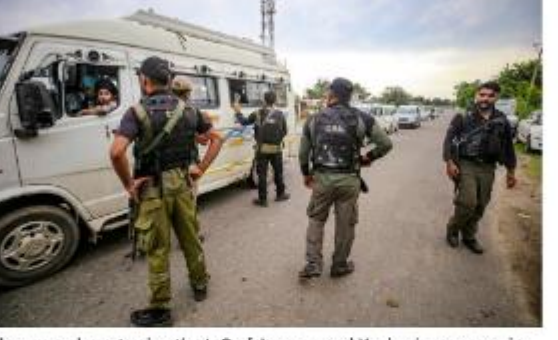
The amendments give the L-G of Jammu and Kashmir more say in matters pertaining to police and public order.

On August 5, 2019, the special status granted to &K under Article 370 of the Constitution was revoked and the former State was divided into two Union notified the amended Rules