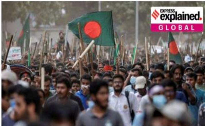
Anti-quota protesters march with Bangladeshi flags and sticks as they engage in a clash with Bangladesh Chhatra League, the student wing of the ruling party Bangladesh Awami League, at the