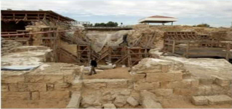
A worker walks on scaffolding at the archaeological site of the Saint Hilarion Monastery in central Gaza Strip.