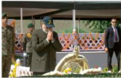
In memoriam: Narendra Modi pays homage at the Kargil War Memorial on the occasion of Vijay Diwas, in Dras, on Friday.

Referring to the Opposition's criticism of the Agnipath scheme, Mr. Modi said, "Unfortunately, people have made such a sensitive issue related to national security a subject of politics. These are the same people who weakened our Army by committing scams worth thousands of crores in the Army. These people never