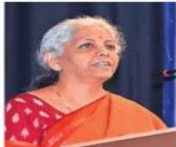
Nirmala Sitharaman, Union Finance Minister. File

THE GOVERNMENT aims to open more than 3 crore accounts under the Pradhan Mantri Jan Dhan Yojana (PMJDY) during the current financial year 2024-25, Finance Minister Nirmala Sitharaman said on Tuesday. On the eve of the PMJDY completing ten years, Sitharaman said the scheme has helped the government to reach out to people, especially in identifying people who