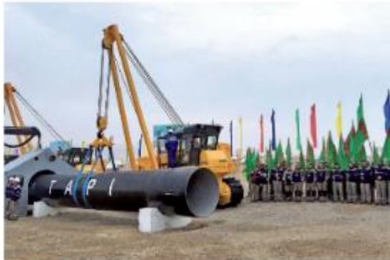
Slow progress: Work on the pipeline has been delayed by security issues in Afghanistan. FILE PHOTO

holiday was declared to mark the occasion, with posters celebrating the project plastered around the capital of the same name.