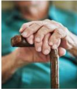
Eligible senior citizens will get a new distinct card under the Ayushman Bharat scheme.

The eligible senior citizens will be issued a new distinct card under the