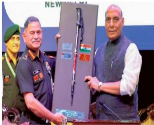
Army chief General Upendra Dwivedi presents a memento to Defence Minister Rajnath Singh on Wednesday.

Describing border area development as a core component of national security, Army chief General Upendra Dwivedi said a developed area with a strong economic and tourist activity acts also as a deterrence