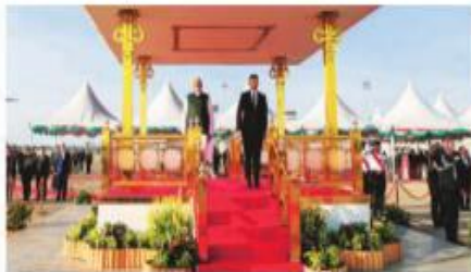
PM Narendra Modi was received by Crown Prince Haji Al-Muhtadee Billah upon his arrival in Brunei Darussalam.

Modi said he was looking forward to his meetings with Sultan Hassanal Bolkiah and other