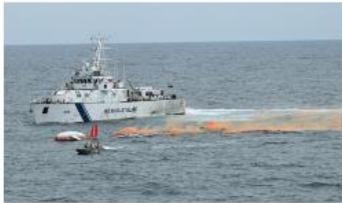
The new acquisition will enhance the capability of the ICG to carry out surveillance, and patrolling of maritime zone.

Of the total cost of AoNs, 99% is from indigenous sources under Buy (Indian) and Buy (Indian-Indigenously Designed, Developed and Manufactured) categories of the defence acquisition procedure, the