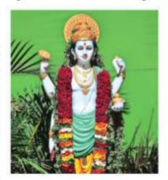
A depiction of Dhanvantari.