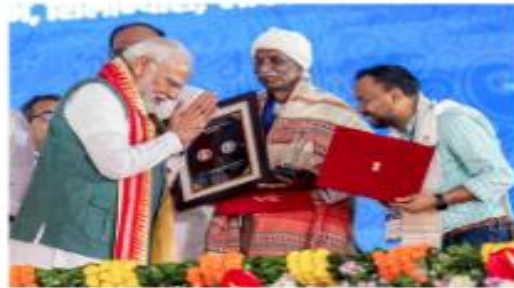
Prime Minister Narendra Modi greets a descendant of Birsa Munda, Budhran Munda, on Friday.

Jamui district shares a border with the neighbouring State of Jharkhand where the second phase of polling for the Assembly election is scheduled to be