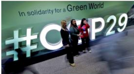
Green image: Women posing for a picture by the logo of the United Nations Climate Change Conference in Baku on Friday.