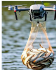
Demonstration of transportation of fish using a drone near the Central Marine Fisheries Research Institute in Kochi on Friday.

"Drones play a pivotal role in managing aquaculture farms, monitoring fish markets, and assessing damage to fisheries infrastructure, particularly during natural disasters, when rescue operations are essential. On their part, underwater drones help closely