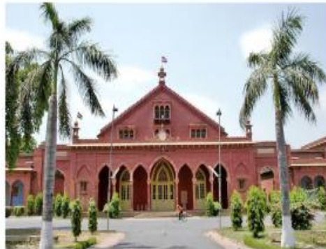
Seeking clarity: The court's judgment was based on petitions seeking minority status for the Aligarh Muslim University.

The majority judgment authored by the Chief Justice was based on petitions seeking minority status for the Aligarh Muslim University (AMU). Chief Justice Chandrachud held that an institution established by a minority community was indeed a minority educational institution. But the