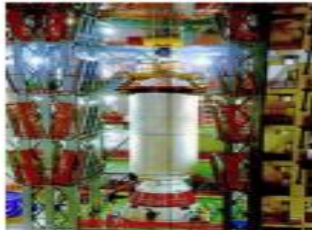
The ISRO begins assembly of HLVM3 in Sriharikota on Wednesday.

"L110 and C32 stages for the HLVM3 are ready at the