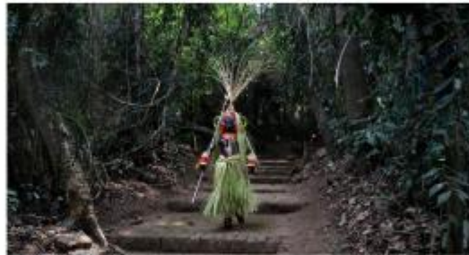
Save biodiversity: These small forests are commonly found in Tamil Nadu, Kerala, Karnataka and Maharashtra.