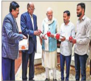
PM Narendra Modi with NCP (SP) chief Sharad Pawar and farmers during a meeting in Delhi, Wednesday.

"India and Kuwait share traditionally close and friendly relations which are rooted in history and have been underpinned by economic and strong people-to-people linkages. India is