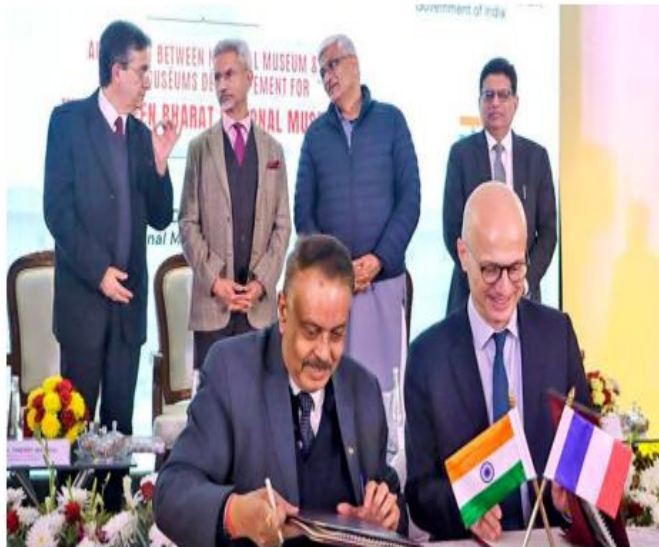
The delegates from India and France sign the agreement for the

India and France on Thursday signed a Memorandum of Understanding (MoU) for the development of the new National Museum, on the lines of the Louvre in Paris, at the historic North Block and South Block in the national capital. The museum, named Yuga Yugeen Bharat, when com-