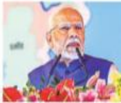
Prime Minister Narendra Modi addresses an event in Khajuraho, Wednesday.