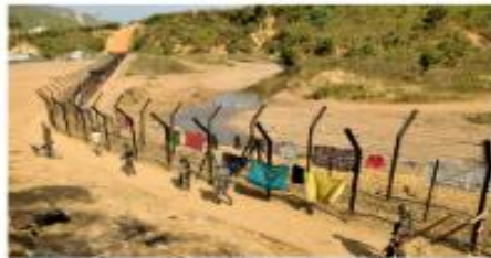
Dividing line: The 1,643-km-long border with Myanmar runs along Arunachal Pradesh, Nagaland, Manipur, and Mizoram. FILE PHOTO

Home Minister Amit Shah had announced on February 8 that the FMR had been scrapped to ensure internal security of the country and to maintain the demographic structure of the northeastern States. However, the new guidelines indicate that the regime has not been done away with but stricter regulations, such as reducing the range of free movement to 10 km from the ear-