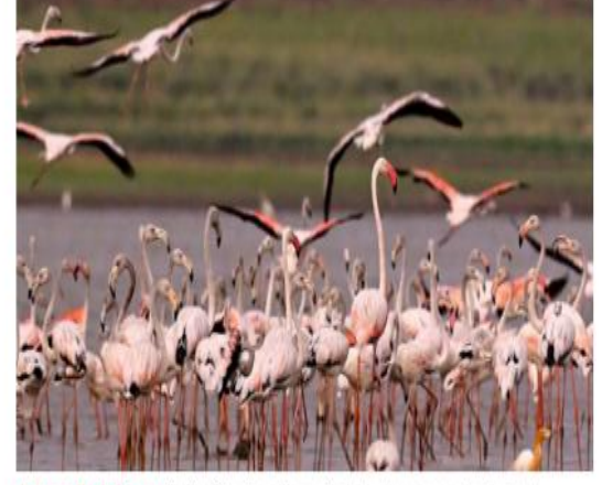
Winged visitors: A similar flamingo festival was conducted at Sullurpeta in 2020. NAGARA GOPAL

Expectations are high among nature lovers and birdwatchers as the fest was last conducted in 2020. Over 200 varieties of birds are expected to fly to this region during this season. Andhra Pradesh Chief Minister N. Chandrababu Naidu has already informed the district administration to conduct the