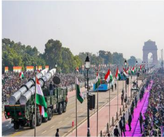
The Pralay Weapon System on display during the full dress rehearsal for the Republic Day parade in New Delhi on Thursday.

With a range of 400 kilometres, Pralay adds to the BrahMos and Parahar missiles already in the invento-