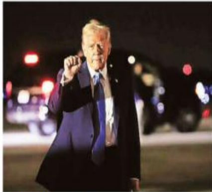
US President Donald Trump.

International trade experts said that India has already begun lowering tariffs to favour US exports in a bid to avoid Trump's tariffs. Duties on items primarily exported by the US, such as motorcycles with an engine capacity below 1,600cc, ground installations for satellites, and syn-