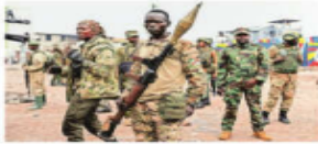
M23 rebel group members in North Kivu province, Congo.

RWANDAN-BACKED M23 rebels in the Democratic Republic of Congo are seeking to advance south towards Bukavu, the capital of South Kivu province, to expand their area of control in the country after capturing the city of Goma. The latest fighting is part of a major escalation of a decades-old conflict over power, identity, and resources that has killed hundreds of thousands of people and displaced more than one million since its resurgence.